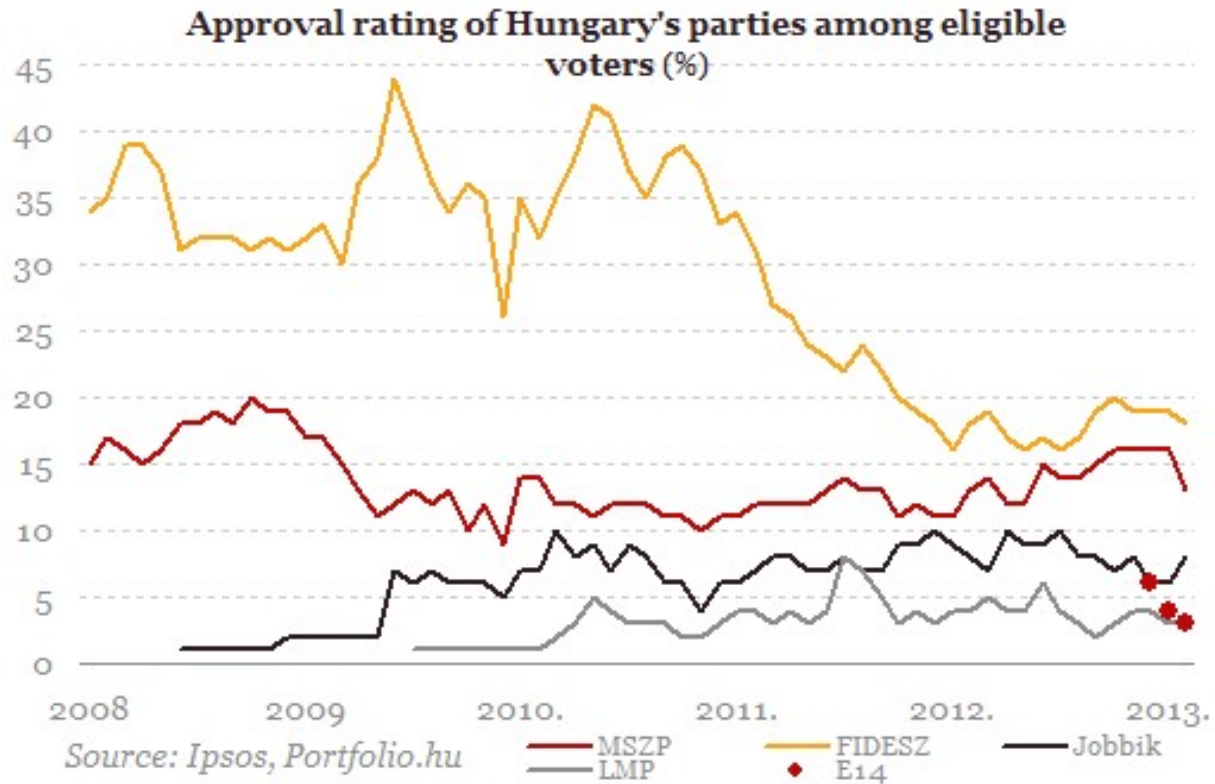
Figure 1: Political Party Popularity in Hungary 2008-2013